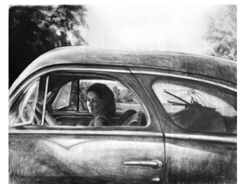
Work by Eva Crawford

Following the passing of her father in Jan. of 2021, Crawford sought to create a body of work focused on the preservation of memory. Crawford reclaims lost memories through the use of portraiture, transforming antique film photographs into large-scale drawings and paintings that invite the viewer to create their own stories and memories about the individu-