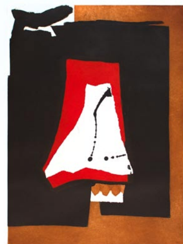
From Alphabet Series by Robert Motherwell

Hughes Gallery , 2015 Ayrsley Town Blvd. @ N Kings Parade, Ste. 107-c, Charlotte. Ongoing - The gallery is a modern art gallery with a focus on sculpture, installation, works on paper, photography and painting. Hours: Mon.-Sat., 10am-6pm. Contact: 704/492-9934 or at ( www.hughesgallery.artlogsites.com ).