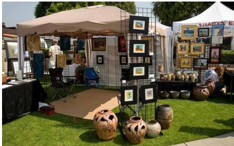
A view of a couple of artist's booths

The South Carolina Festival of Flowers Juried Art Show is a sanctioned event hosted annually by The Arts Center of Greenwood in coincidence with the South Carolina Festival of Flowers. The exhibit celebrates its 11th year in The Arts Center's main gallery in 2017 and will feature work from artists all over South Carolina and divisions of the southeast. The show will be on display during the month of June at The Arts Center. The event is presented by the Arts Council of Greenwood County.