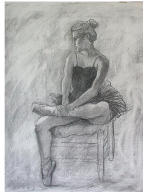
Work by Denise Waldrep

In Waldrep's artist statement, she says, "I work to create images which allow glimpses of the energies that animate and permeate the material world around us. Those energies may manifest as human emotion in portraits, the radiant energy of light in plein air studies or as myths finding expression in the shapes of forest trees and other forms of nature. In some pieces, I show this through use of gestural lines or the play of darks and lights. In other works, I may use pattern and geometry coming though in unexpected ways. It's always exciting to see where the interaction between my work in progress