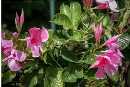
And of course there will be lots of flowers

The event features original work from talented artists and crafts people from all over the Southeast. All juried exhibitors' work has been handmade by the exhibitors and must be their own original design and creation. See the creative process in action with several of our exhibitors demonstrating their craft in their booths, something for every taste and budget with items from the most contemporary to the most traditional.