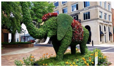
One of the topiaries you'll find along the street