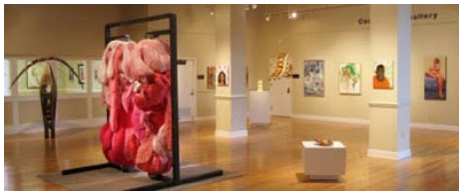
A view of one of the Juried Art Shows

The South Carolina Festival of Flowers Juried Youth Art Show was established in 2015, as a sanctioned event in coincidence with the Festival, with funding attributed to an established endowment in the name of the late Virginia Self. The show will be on display in the reception hall during the month of June at The Arts Center of Greenwood and will include works by regional youth artists (K-12).