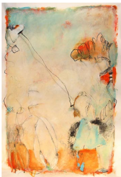
Work by Eileen Blythe

ArtFields took place in Lake City, SC, from Apr. 19 - 28, 2013. It was the largest arts competition of its kind in the Southeast. This 10-day epic Southern artfest featured a wide variety of art events, including an art competition, workshops, lectures, talks, public art and more. The exhibition offered 400 pieces of two- and three-dimensional artwork selected from artists in 11 Southeastern states. These original works were exhibited in more than 40 downtown businesses and other