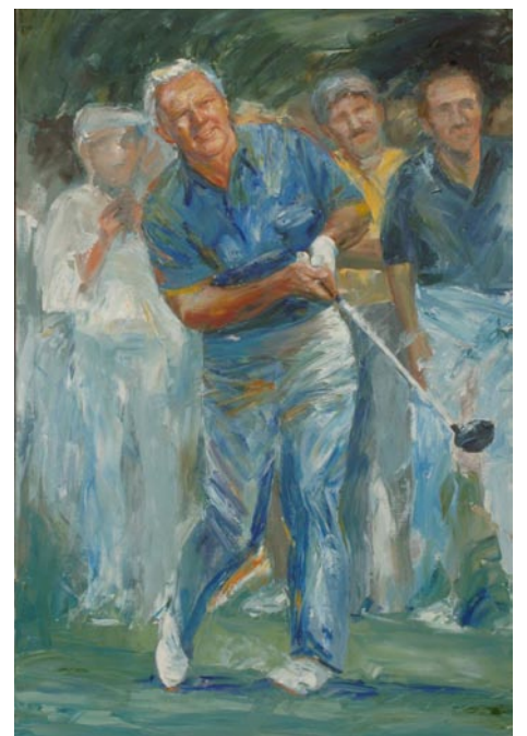
Lucy McTier, The Palmer Finesse , 1994, oil on canvas, 36 x 24

Fore! Images of Golf in Art was organized with the assistance of Harmon-Meek Gallery in Naples, FL, the United States Golf Association, private collectors and regional museums. The exhibition features