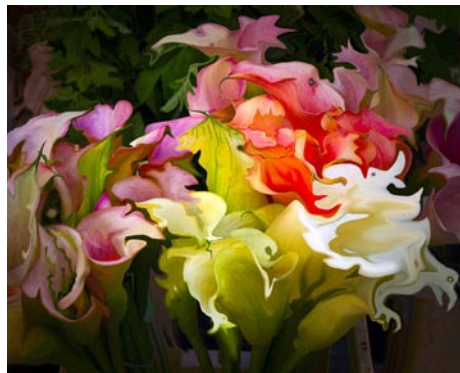
Work by George Watson

Art League Gallery features local artwork in all media created by more than 170 member artists. All artwork on display is for sale and exhibits change every month.