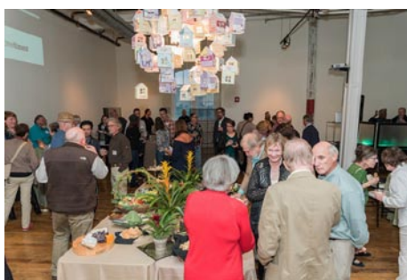
Preview Party