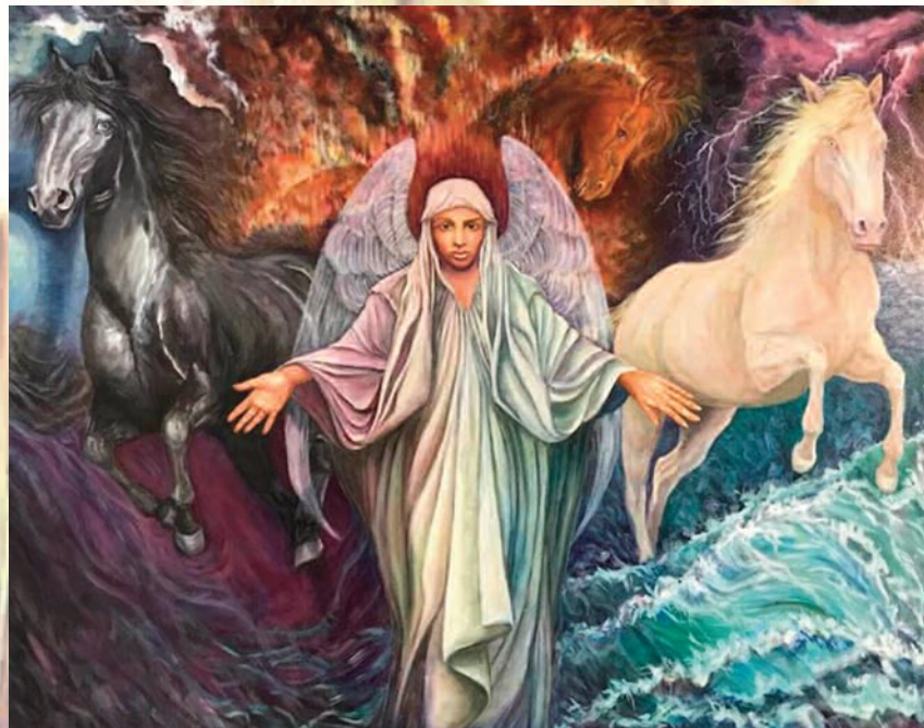
2018 Best of Show: Dale Bishop Wind, Fire, Water - Oil