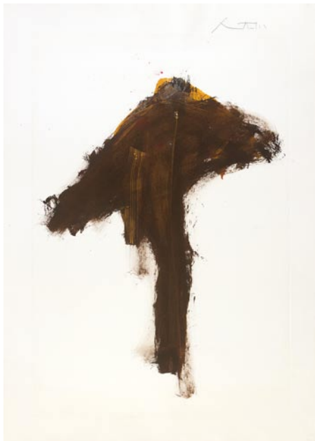
Work by Robert Motherwell