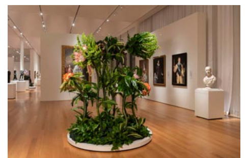
View from a previous "Art in Bloom" event

Tickets for members and nonmembers are on sale now. Ticket pricing is as follows: • $30 Members • $33 Nonmembers • Free for children 6 and under Tickets are available at ( ncartmuseum.org/bloom ) or