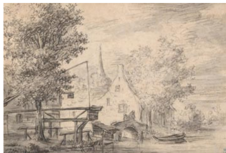
Jacob van Ruisdael, Dutch, 1628/9-1682, "Riverbank with a Wooden Aqueduct and View of a Village", c. 1650, black chalk and gray wash on paper, 6 3/16 x 9 3/16 in. (15.7 x 23.3 cm). Ackland Art Museum, University of North Carolina at Chapel Hill. The Peck Collection, 2017.1.74.