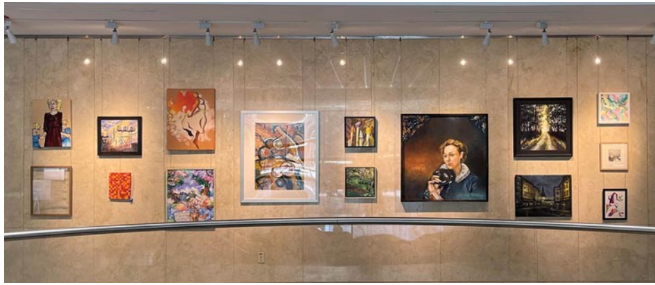
View of the "16th City of Raleigh Employee Exhibition".

The City of Raleigh in Raleigh, NC, is presenting the 16th City of Raleigh Employee Exhibition , part of the National Arts Program, on view in the Block Gallery (inside Raleigh Municipal Building), through May 19, 2023. A reception and awards ceremony will be held on Mar. 30, from 5:30-7:30pm.