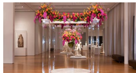
View from a previous "Art in Bloom" event