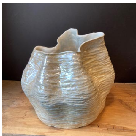
Work by Gale Ray

Myths from the Sea is a collection of paintings and pottery inspired by shells from the sea. Says Ray, "It all came about one day when I was sitting in my studio contemplating a painting of a triton shell, King Triton . I thought, 'wouldn't it be interesting and challenging to make a large pot imitating the texture of that shell.' I began coiling and pinching out the clay by hand to form the pot. After a couple hours, it began to take shape. When I finished, I cried and thought 'now you have something special.'"