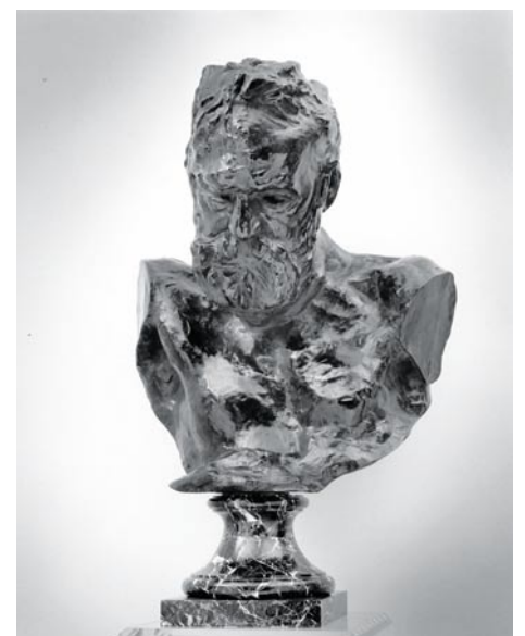
Auguste Rodin, "Heroic Bust of Victor Hugo", bronze, detail, 29 1/4 x 23 1/2 x 21 1/4 in., Executed: 1890-97 or 1901-02; cast: Musée Rodin 7/12, 1981. Collection Iris Cantor.

"I am confident that viewers will find this show's 17 bronze Rodin sculptures to be a stunning installation featuring works that span the artist's long career," Foti ex-