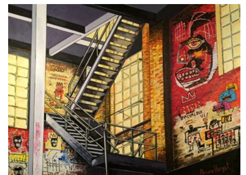
Work by Perviz Heyat

For this show Perviz selected items from the streets of an ordinary city that he photographed and painted them in a modern pop art style. These familiar items such as power poles, mail boxes, interior of an abandoned factory, or a pile of tires no longer look displeasing, but rather interesting and welcoming objects of our daily lifestyle. In this show what we normally think as unnatural and unattractive part of the urban life now