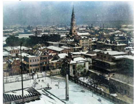
"Birds-eye view of Charleston rooftops overlooking Washington Square Park". February 1899.

For further information check our SC Institutional Gallery listings, call the Museum at 843/722-2996 or visit ( www.charlestonmuseum.org ).