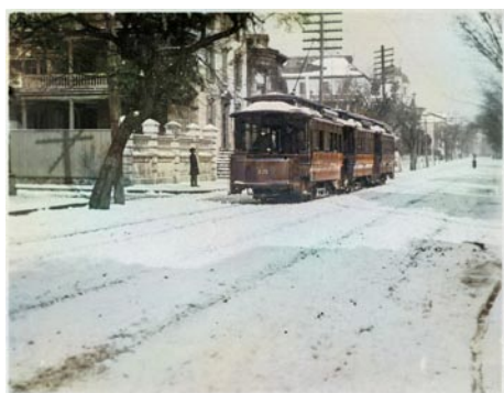
"Meeting Street trolley car making stops in the snow". Captured by Morton Brailsford Paine, February 1899. Courtesy of The Charleston Museum.

For years, photograph colorization was used mainly by high tech production companies. Recently however, computer programmers have created colorization operating systems that use Artificial Intelligence. Modeled after the human brain, the AI software can recognize objects in a photograph and determine their likely colors. Although, it can still be time consuming and rather tricky, colorizing a historical photograph is now more accessible to everyday users. Visitors are invited to enjoy this collection from the Museum's Archives through a new lens of colorization.