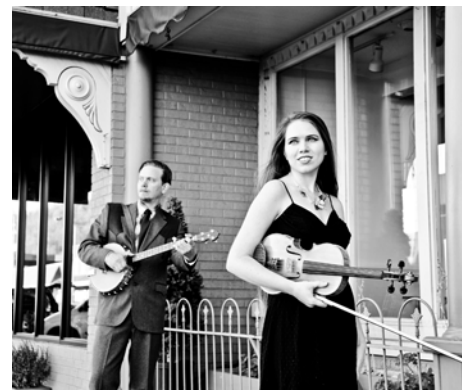
Whitotop Mountaineers.

At 3pm - Moore Brothers Band. Led by a duo of young brothers from Hickory, NC, this band plays bluegrass and gospel.