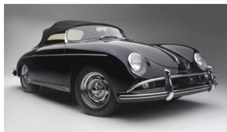
Porsche Type 356A Speedster 1600 Super, 1958, Collection of Chad McQueen

" Porsche by Design brings together one of the most significant collections of Porsche automobiles ever assembled," said Ken Gross. "More than 'just a show about cars,' the exhibition emphasizes the innate beauty of aerodynamic design, inseparably linked with engineering genius. It further illustrates the Porsche family's