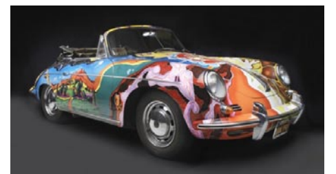
Porsche Type 356C Cabriolet, 1965, Collection of the Joplin Family, Courtesy of the Rock and Roll Hall of Fame and Museum, Cleveland, Ohio, Photograph © 2013 Peter Harholdt

The Museum is also producing a full-color exhibition catalogue with photographs by Michael Furman and Peter Harholdt. The catalogue features essays by Ken Gross, Robert Cumberford, Jeff