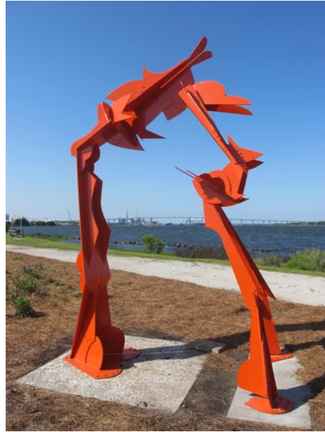
Daddy Longlegs by John Parker

sculptures using clay forms to create a silicone mold for recycled glass, which is fired to 1650 degrees Fahrenheit. As the molten glass takes the shape of the mold, it can take anywhere from a couple of weeks to a couple of months to cool to room temperature. For further information check our SC Institutional Gallery listings, call the Museum at 803/799-2810 or visit ( www.columbiamuseum.org ).