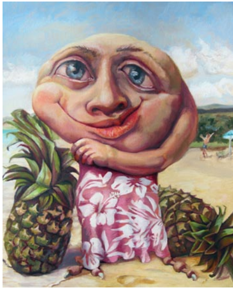
Work by Jill Eberle

GreenHill, a space for NC art, in Greensboro, NC, is presenting ANIMATED! , a comprehensive overview of the influence of animation on visual arts, on view through Nov. 9, 2013. Curated by Edie Carpenter, the exhibit presents works by 22 artists who investigate animation from 19th century animation devices to the elaboration of original animated worlds. The exhibition explores sequential art from flip books and storyboards to Claymation, and present works on paper as well as digital media. The influence of animation on other art forms including jewelry, pottery, sculpture and painting will also be explored. For further information check our NC Institutional Gallery listings, call the center at 336/333-7460 or visit ( www.greenhillnc.org ).